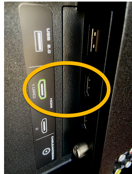
Most modern TVs have an HDMI output.

Please read this more detailed article about the various connections to your TV, as well as mirroring displays.